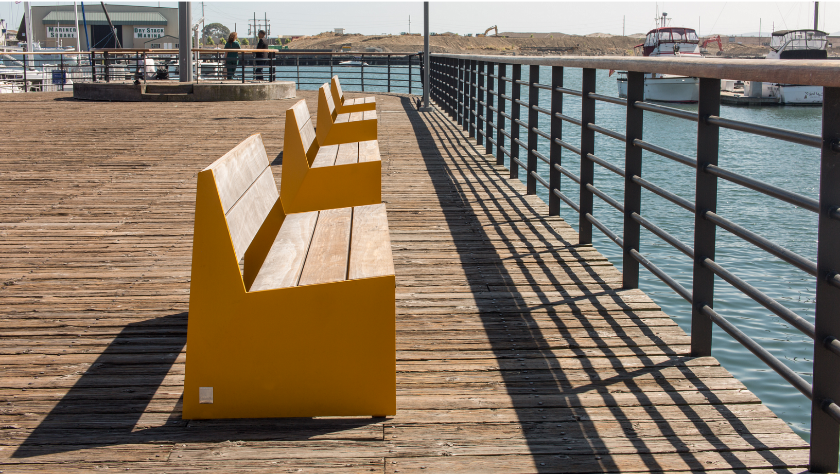
Vestre benches fabricated with Kebony Clear Decking.