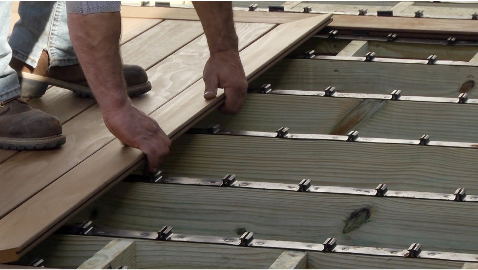
DuraLife™ Step-Clip™ for Kebony